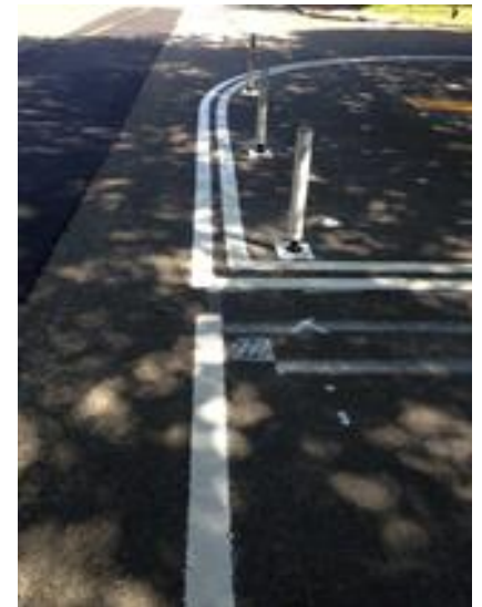
Upcoming changes on NE 140th St and 32nd Ave NE